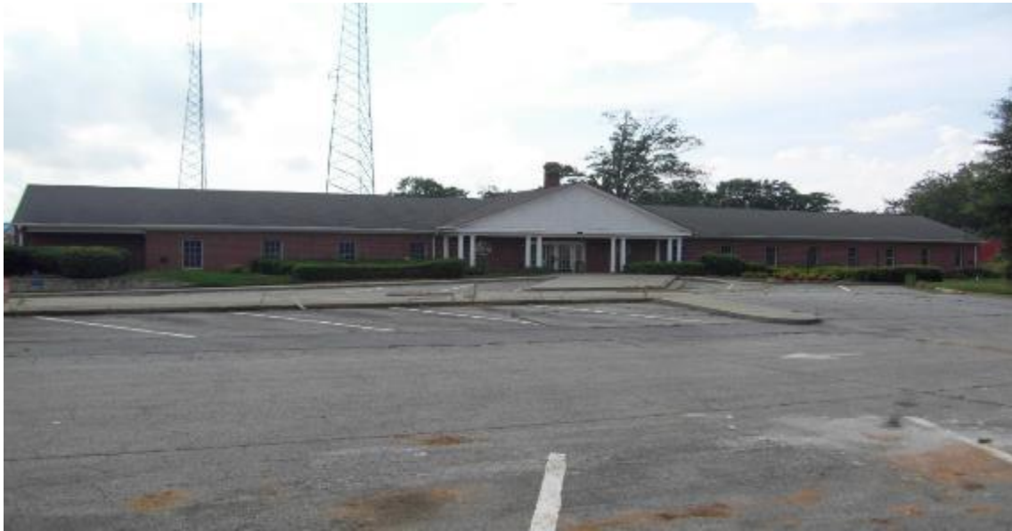
Building 162: Front façade