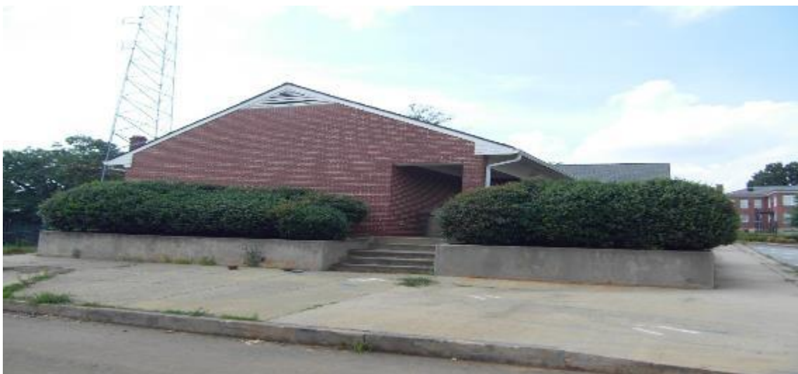
Building 162: Side (south) elevation