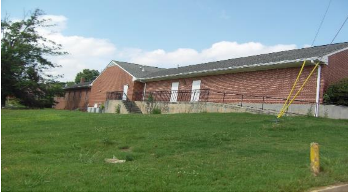
Building 162: rear (west) elevation