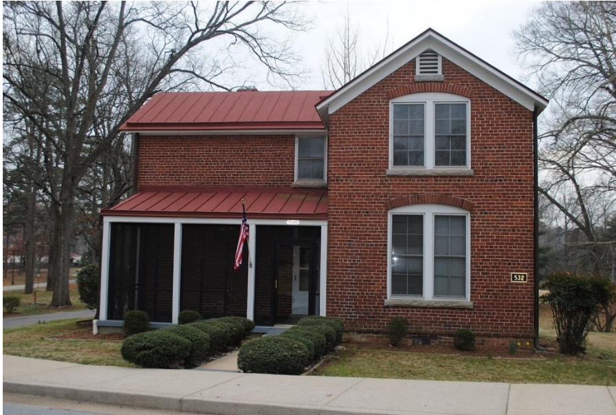
Building 532: Front façade