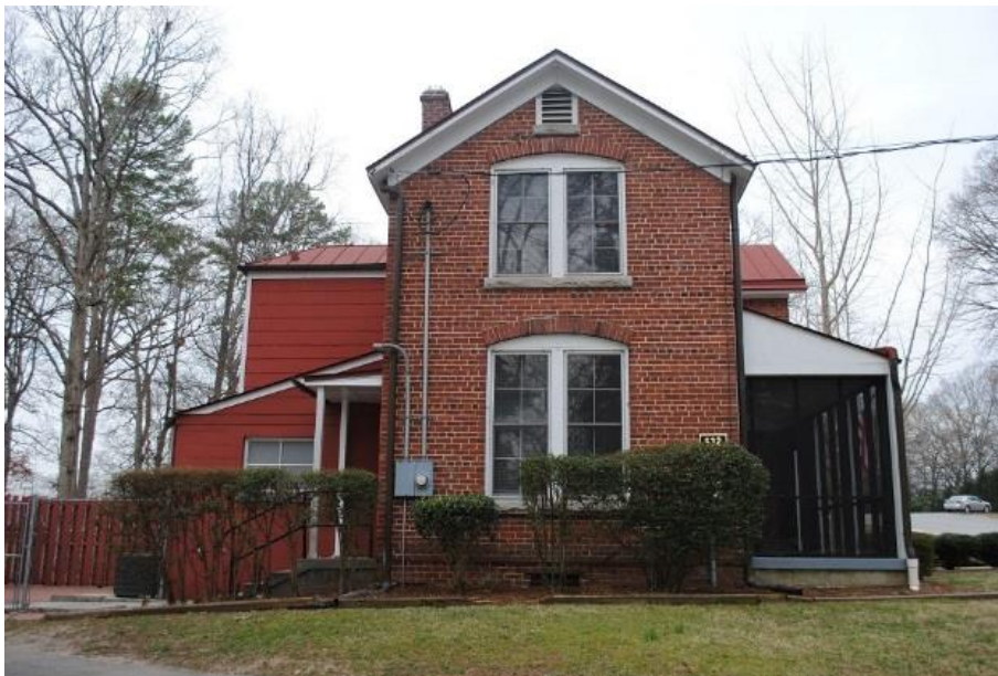
Building 532: South-east corner