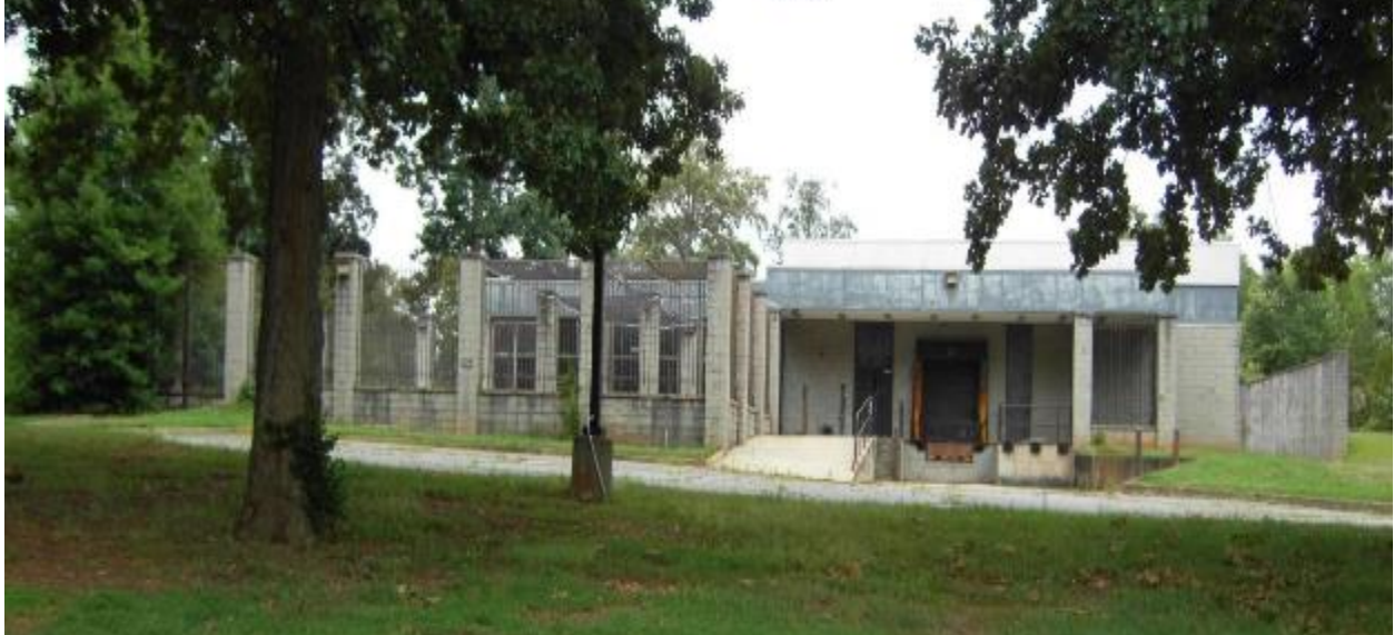
Building 238: Front façade

1740 Thorne Avenue is situated within the former Office and Medical District at Fort McPherson. This building is bound in the north by Sayers Street and in the south by Walker Avenue. The detached, one-story, rectangular-cored, irregular structure was built in 1986 and was used as a mini-mall. Potential uses for this building include single or multitenant retail, restaurant, office, and flex space. The building is constructed of sandcrete block walls in brick formation with pointer laceration joints. The US Army reports the square footage as approximately 38,830 sq. ft.