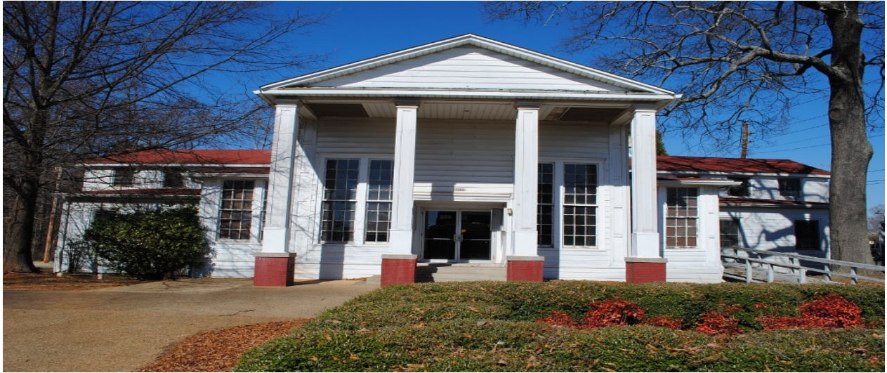
Building 46; Front façade

The Historic Red Cross building is located at 1219 Haney Plaza within the Historic District near the original, gated entrance to Fort McPherson. Constructed in 1919, it was used as a convalescent building for patients from the hospital and later converted to a service club. It is one of the few remaining Red Cross buildings built in the shape of the Maltese cross. The building is approximately 8,450 sq. ft.