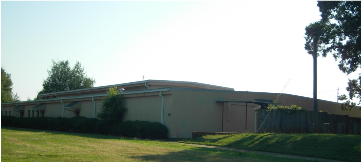
Rear (southwest) elevation

1788 Hardee Avenue is located within the planned Production-Supported Retail District. This building is bound in the north by the main entrance parking lot, on the west by the Forces Command building, on the south-west by the Third Army/Army Central building and on the east by Lee Street. The detached; one-story rectangular structured sand screed building was constructed in 1945, measures 17,334 sq. ft. and was used as a space for telecommunication, video production and photography.