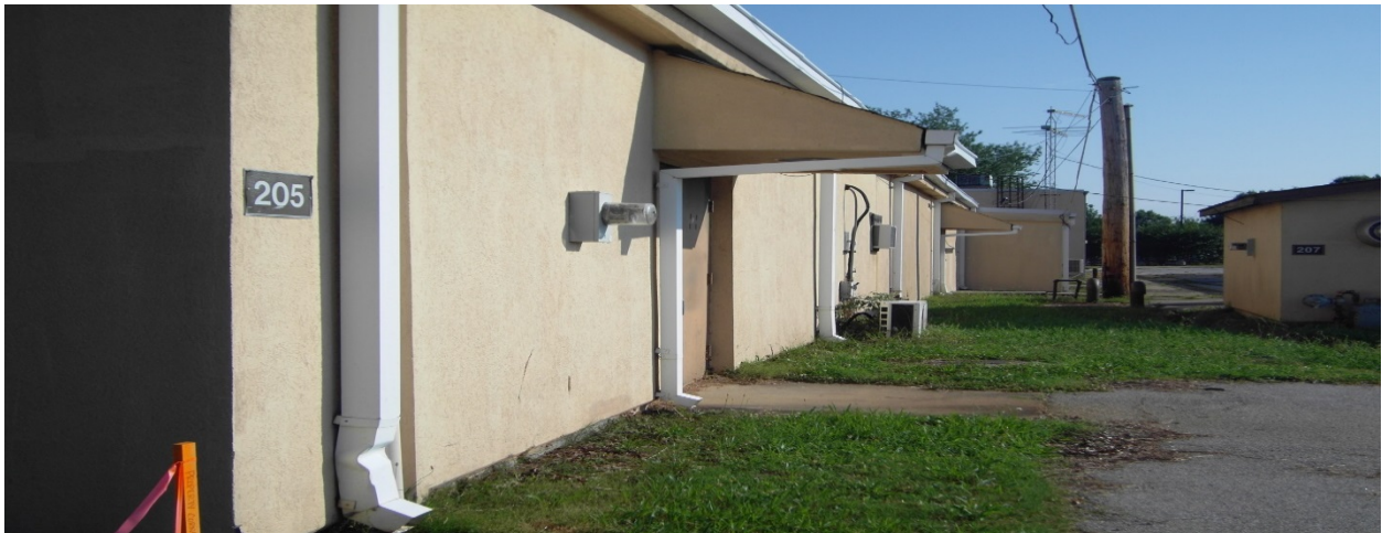
Side (east) elevation